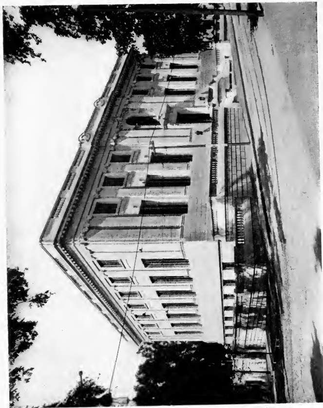
JOHN HAY MEMORIAL LIBRARY